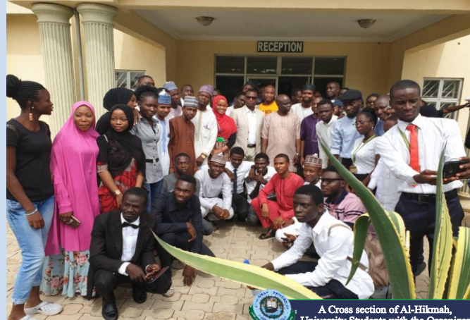
A Cross section of Al-Hikmah, University Students with the Organizer

He therefore, implored the Management to continue to extend