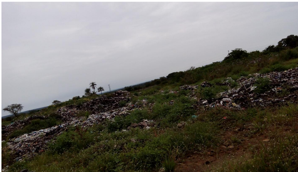
Figure 2: Gbagede dumpsite in Amoyo, Kwara State

Raw leachates were collected from three sampling points of the dumpsite (Figure 2) and thoroughly mixed to provide a homogenous representative sample. Groundwater samples were also obtained from the site under study. The groundwater within the dumpsite (50 m) was labeled groundwater 1 (GW1) while the groundwater that was 150 m away from the dumpsite was labeled groundwater 2 (GW2). Each of the water samples was separately collected in sterilized 5-litre jerry can.